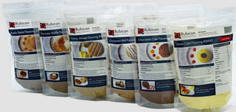
Assorted Purée Bread Flavorings