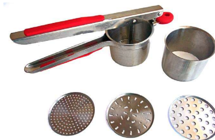
Purée Ricer Tool for shaping pasta and rice.