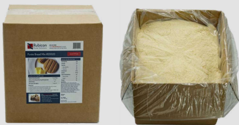
Purée Bread Mix Case