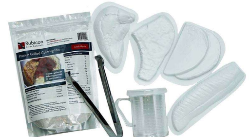
Protein Shaping Molds